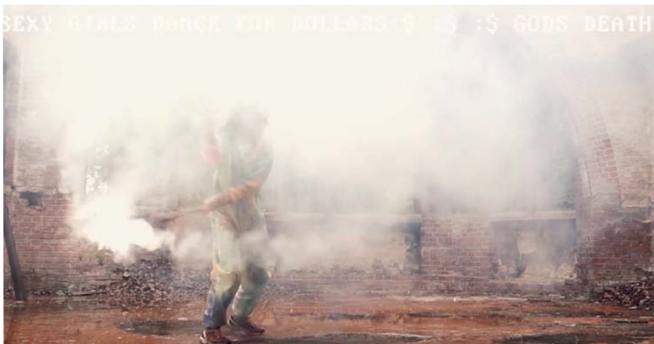
Video still, MEAT SPACE # MY GIRLFRIEND IS THE REVOLUTION PUNK IS DADA, PUNK IS DADA