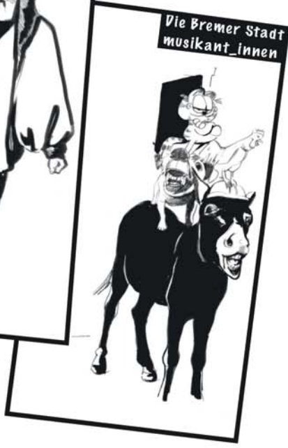
Die Bremer Stadt muskant_innen