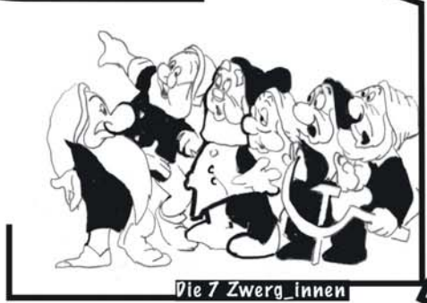
Die 7 Zwerg_innen