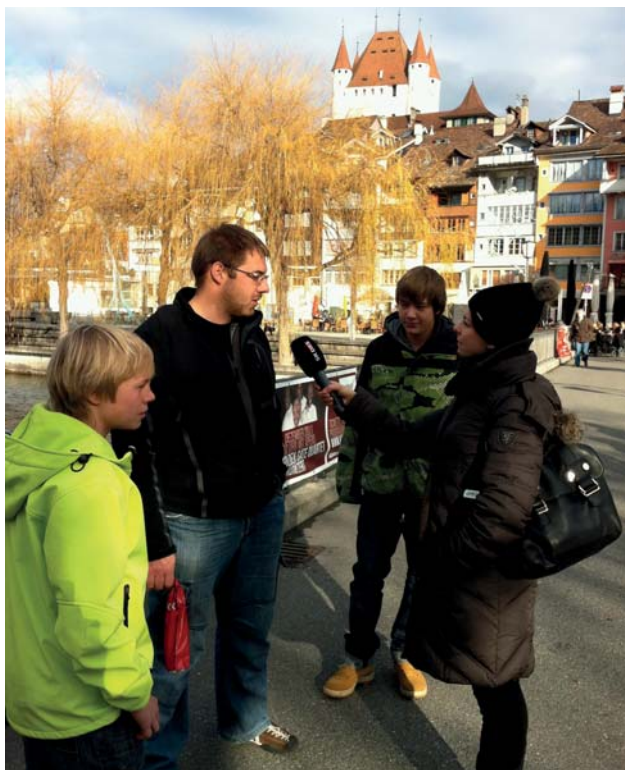
Interviews with citizens of Thun led by students of the Postgraduate Programme in Curating