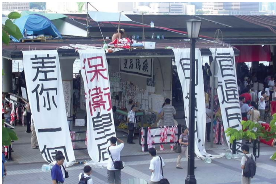
The Star Ferry protesters occupy the adjacent Queen's Pier, which was also due to be demolished.

to be fair, the intention of those who were in charge of the space. The turning point came in the two years leading up to the start of Woofers Ten in 2009, when some of the loudest, most visible mobilisations against the destruction of historic, public, and rural sites took place. Artists played a prominent role in drawing attention to the demolition of the Star Ferry pier in Central (2006-7), as well as to the commercial monopolisation of the public space in front of the Times Square shopping centre in Causeway Bay (2008).