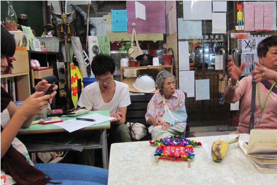
A kai fong meeting at Woofer Ten.