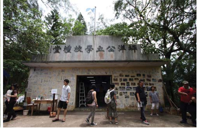
The Ping Che Village School Festival.