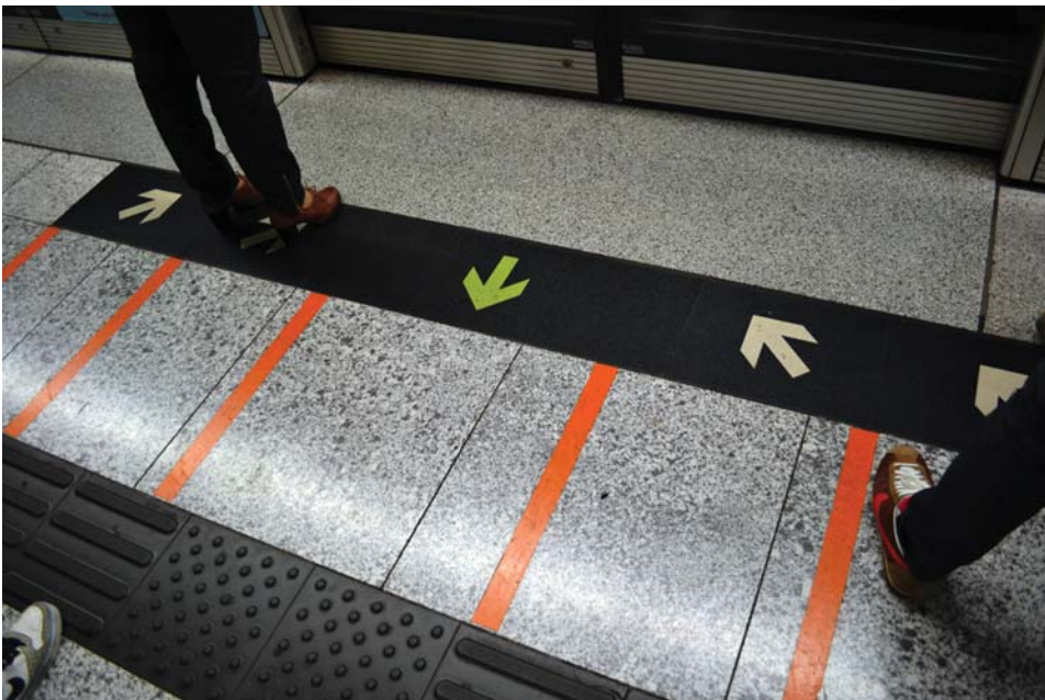
MTR place markers.

While waiting for the MTR, there are clear place markers that let you know where to stand so as not to obstruct those who are trying to leave the train. Once you shuffle in, signs abound telling you not to eat, drink, or smoke, to give up your seat to those who need it more than you, and to aim higher: improve your English, study abroad, lose weight, invest in property. At your destination, a looped recording (trilingual, in the local Cantonese as well as in Mandarin and English) accompanies your escalator trip back to street level: stand on the right, watch where you're going, don't just look at your mobile phone. Finally, one last piece of audio instruction as you exit: do not patronise hawkers or give money to beggars. This one I only heard at specific stations.