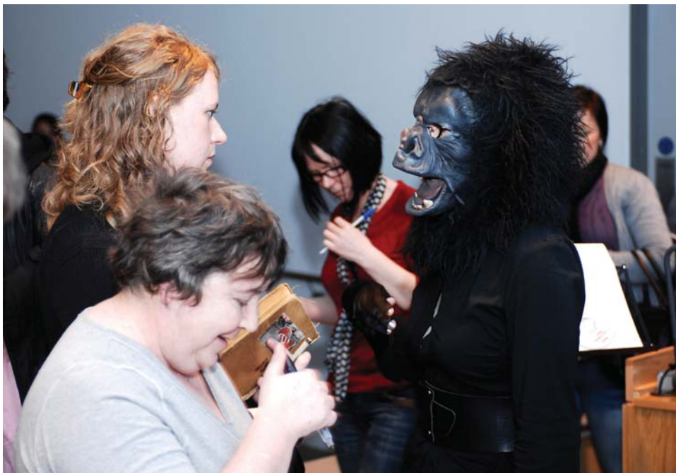
Guerrilla Girls meet young audiences in Cork, Ireland, in 2009, as part of the all-Ireland tour and new work project.

The research carried out included: “gigs” by the Guerrilla Girls to hear from artists, creative workers, collectors, and museum administrators; statistical research by arts activists 9 ; and online comments from the Guerrilla Girls All-Ireland Project website. The research was about listening to others, gathering stories and experiences, and counting—literally a quantitative element that focused on how many female artists were in the collections of the major museums in Ireland—the Ulster Museum in the North, the Irish Museum of Modern Art and the National Gallery—both in Dublin, and the Cork-based Glucksman Museum. Other quantitative research included statistics from the Arts Councils in the Republic of Ireland and the North of Ireland, as well as statistics on female students and outcomes after graduation from the National College of Art & Design and Ulster University. Far from being off put, the museums, the universities and the Arts Councils happily participated in the process. All of this research was then sent to the Guerrilla Girls, who responded to the statistics, the oral archives, and their own instinctual creative processes to create the new work.