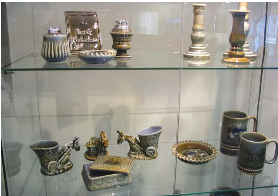
Installation view of exhibition 'Wade Ceramics: Irish Kitsch or Regional Vernacular?', Millennium Court Arts Centre, 2007

In a third example, my colleagues and I set forth to collaborate with a local historical society to present an exhibition within a framework of community curating. The project took place in 2007 and entailed an excavation of the local Wades ceramic factory, a cross-community oral archive of local people who worked there, and the production of new academic knowledge on Wades ceramics. The show was entitled: Wades Ceramics: Irish Kitsch or Regional Vernacular? (2007), which posited several unflattering dichotomies and provocative potential narratives. The show was in juxtaposition to a show on contemporary Irish craft. We often considered the dialogue between gallery spaces as much as more immediate discussions found within the exhibitions site. The public loved the shows and our numbers soared.