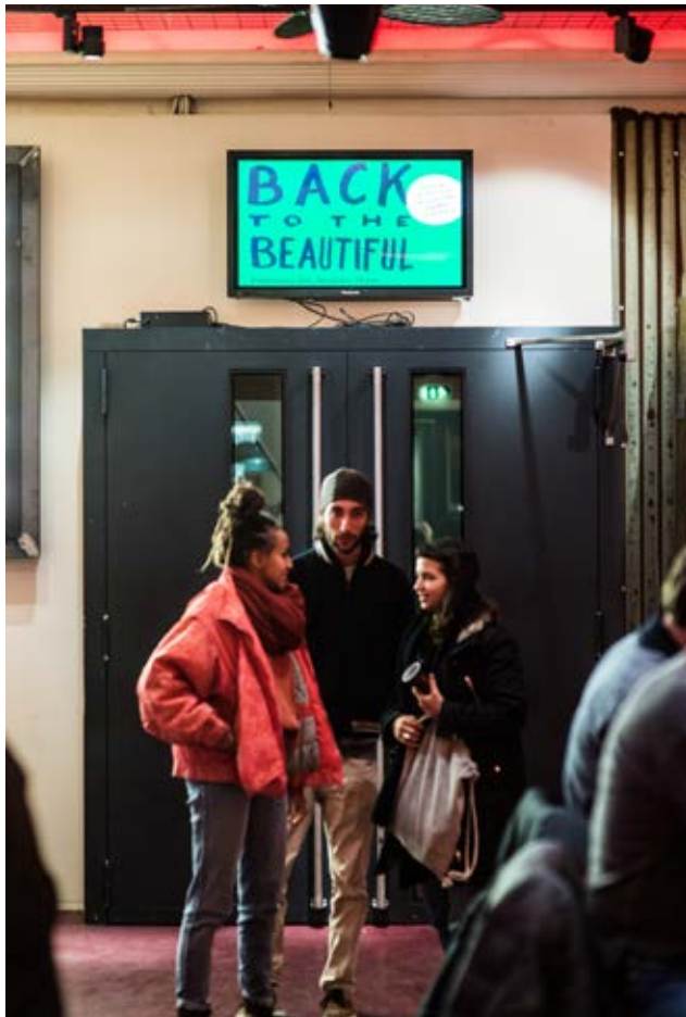
Visitors at the entrance for the group show co-curated by the students of the Curating in the Performing Arts university course, 2017, SZENE Salzburg.

On the other hand, there is the wish of visual artists who desire to engage with performance, the doing that goes beyond the object, the thing in a white cube. ruangrupa, the Artistic Directors for documenta fifteen , proposed the lumbung , or the rice barn, as the way forward for 2022. As they clarified with their press release on 18 June 2020, lumbung is not a theme for the exhibition but an everyday practice. 5 The lumbung proposes a sharing of resources to gain sustainability in the long run. It is a practice of self-governance that advocates a collective responsibility of mutual care. It can be perceived as a common which springs from the Global South. “The lumbung as an artistic and economic model will be practiced alongside its values of collectivity, generosity, humour, trust, independence, curiosity, endurance, regeneration, transparency, sufficiency, and connectivity between a multiplicity of locales, [including Kassel,] rendering them planetary as a result.” 6