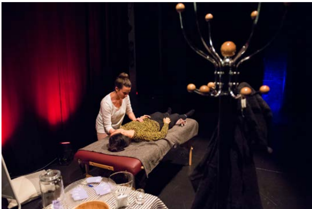
"Care Space" at group show co-curated by the students of the Curating in the Performing Arts university course, 2017, SZENE Salzburg. Photograph

From the Round Table for Dance in 2018, initiated in order to develop a concept for the future of dance in Berlin, several working groups emerged, from which I focus on three in particular which engaged in practices of archiving, mediation, and working