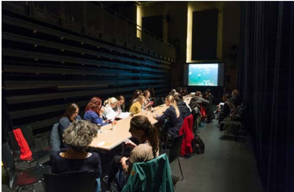
Workshop session at group show co-curated by the students of the Curating in the Performing Arts university course, 2017, SZENE Salzburg.